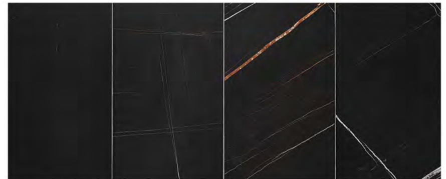
NERO DORATO 12" X 24" HONED MARBLE