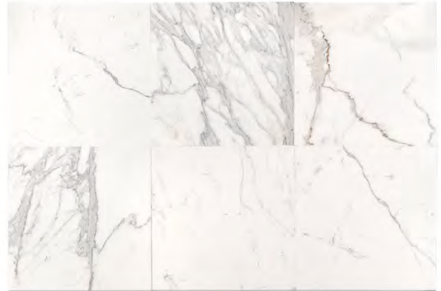
CALCATTÀ ORO 18" X 18" POLISHED MARBLE