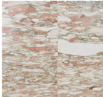
ROSA NORVEGIA 12" X 24" POLISHED MARBLE

Differences in pattern, color, and movement are an inherent part of the beauty of natural stone. Each tile a one-of-a-kind work of art crafted by Mother Nature and no two pieces are ever alike. Let's explore some examples of what these variations could look like.