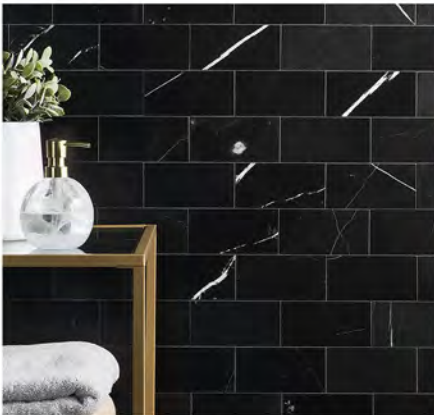
NERO MARQUINA 3" X 6" HONED MARBLE

Natural stone is a product of the earth, formed by water, minerals, and lava for thousands of years. Some stones, such as travertine, display dynamic linear patterns forged by a slow layering of minerals over the years. Other stones, like marble, feature brilliant colors and bold veining created by extreme pressure and temperature. These endless variations are what make natural stone tiles so unique and why we celebrate these materials in design.