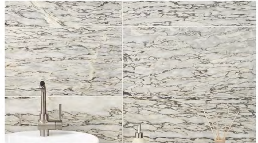
SALAZAR 12" X 24" HONED MARBLE

Designing with natural stone tiles calls for embracing and highlighting its natural movement and variability. Here are a few suggestions for a successful natural stone installation: