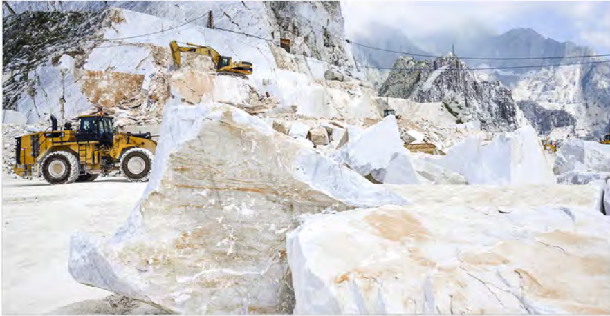
NATURAL STONE EXTRACTION FROM A QUARRY

Natural stone is a product of the earth, formed by water, minerals, and lava for thousands of years. Some stones, such as travertine, display dynamic linear patterns forged by a slow layering of minerals over the years. Other stones, like marble, feature brilliant colors and bold veining created by extreme pressure and temperature. These endless variations are what make natural stone tiles so unique and why we celebrate these materials in design.