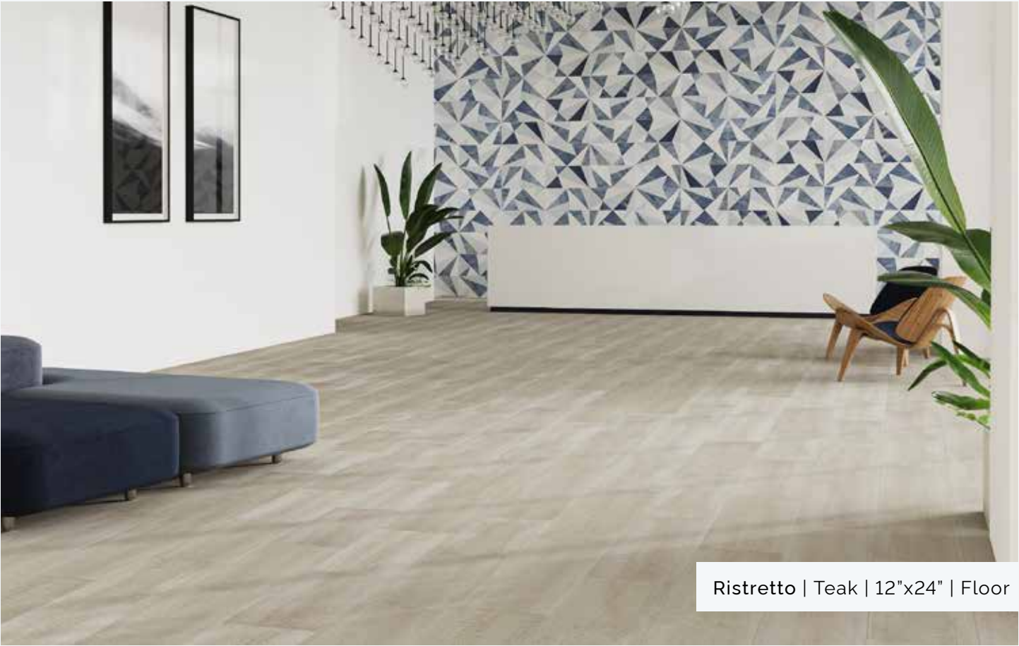
Ristretto | Teak | 12"x24" | Floor