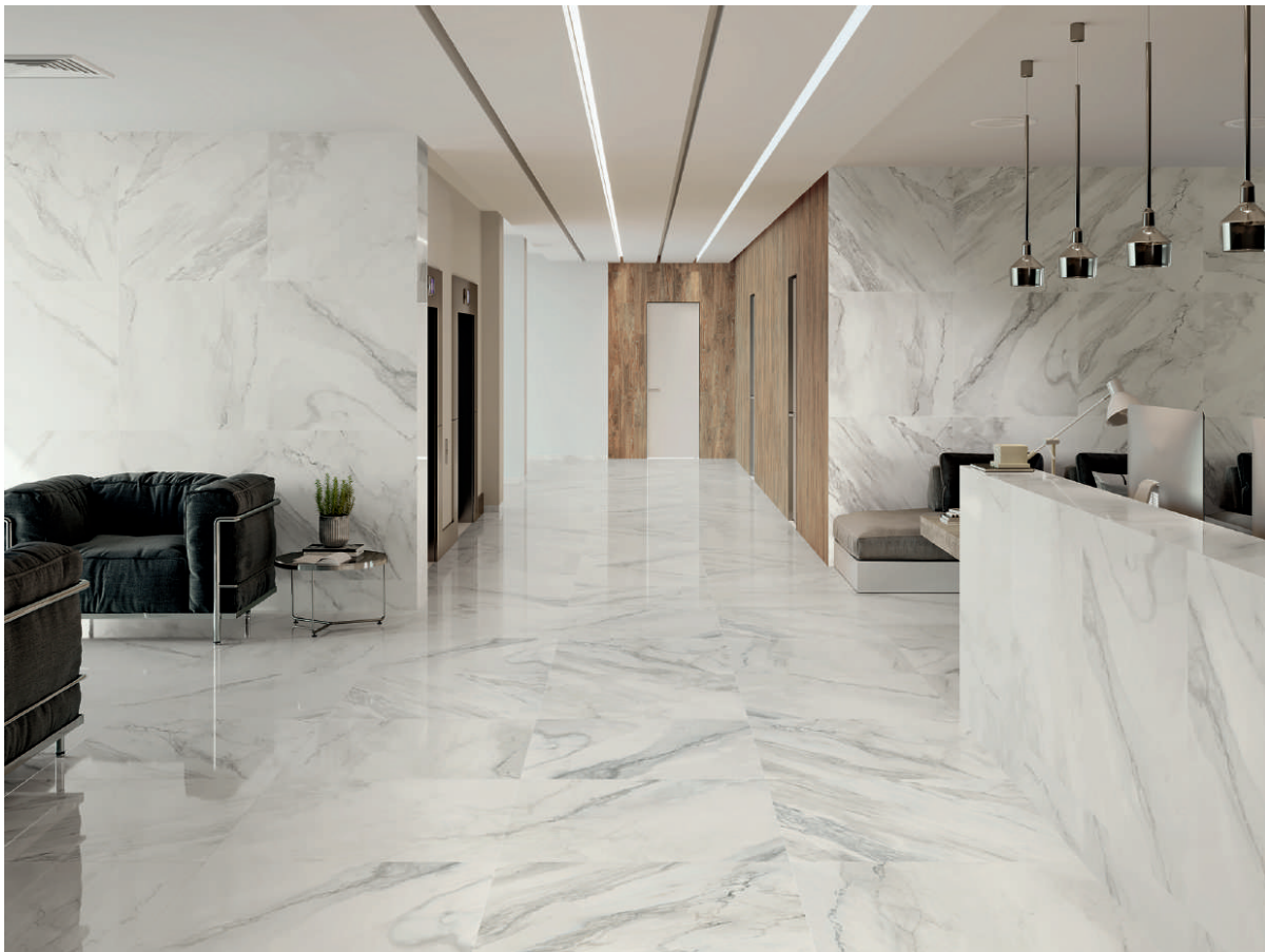
Figure 4. Installed product

Ceramic coverings release no compounds into the soil or water during their use stage because a completely inert product is involved that undergoes no physical, chemical, or biological transformations, is neither soluble nor combustible, and does not react physically or chemically or in any other way, is not biodegradable, and does not adversely affect other materials with which it enters into contact such that it might produce environmental pollution or harm human health. It is a non-leaching product, so that it does not endanger the quality of surface water or groundwater.