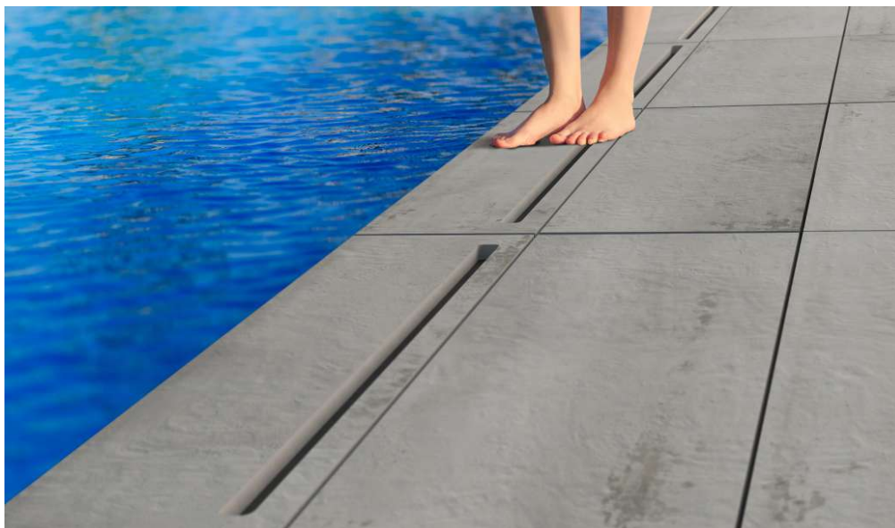
Figure 2. Installed product