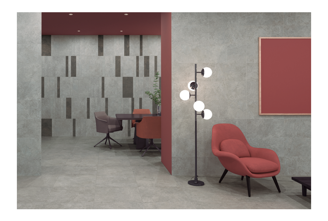
Figure 2. The tiles when laid.

The following table shows the technical properties of all the ceramic tiles in accordance with the requirements of the UNE-EN 14411:2016 standard.