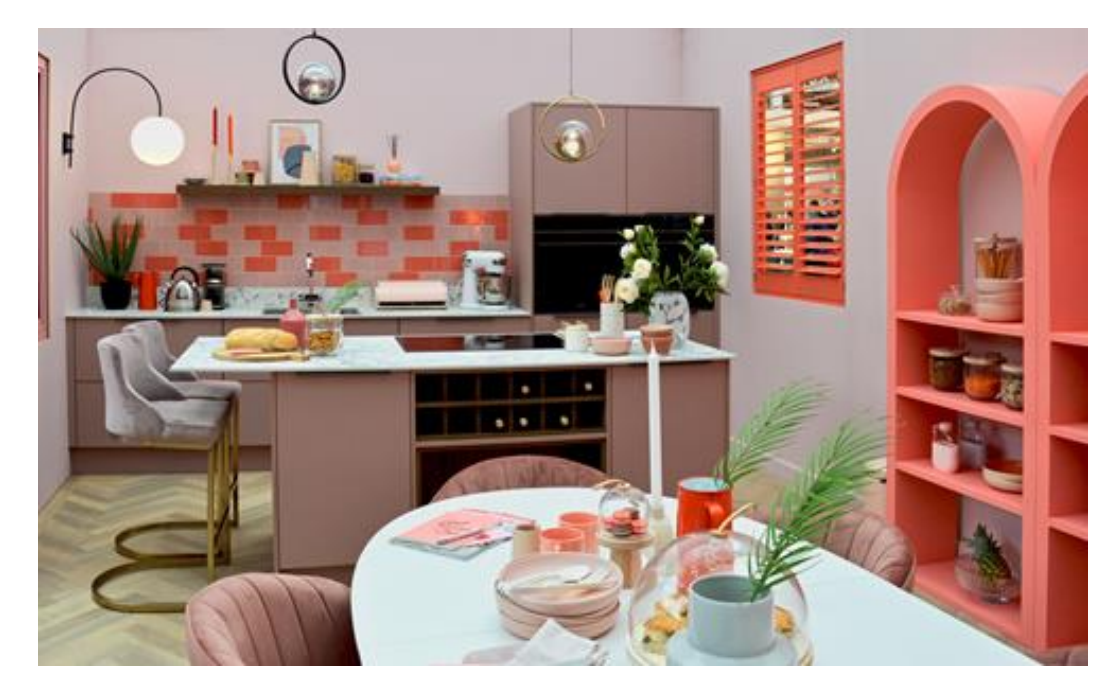
Figure 5 Installed product.

The environmental burdens and benefits of obtaining secondary material from waste generated at the manufacturing stage (waste such as cardboard, plastic and wood), at the installation stage (product losses, tile packaging waste: cardboard, plastic and wood) and at the end of life of the product have been considered.