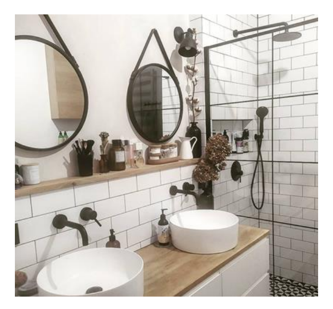
Figure 4 Installed product.