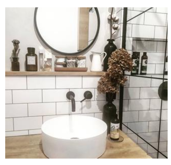
Figure 2 Installed product.

The Life Cycle Assessment (from now on LCA) has been carried out using GaBi 10.0.0.71 [5] software and the data base version 2020.1. (SP40.0) [6] (SpheraSolutions). The characterization factors used are those included in EN 15804:2012+A1:2013 standard.