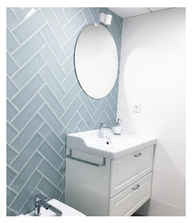
Figure 1 Installed product.

The product features are included in the technical datasheets which can be requested from the manufacturer, being them, the ones required by the EN 14411:2016 standard.