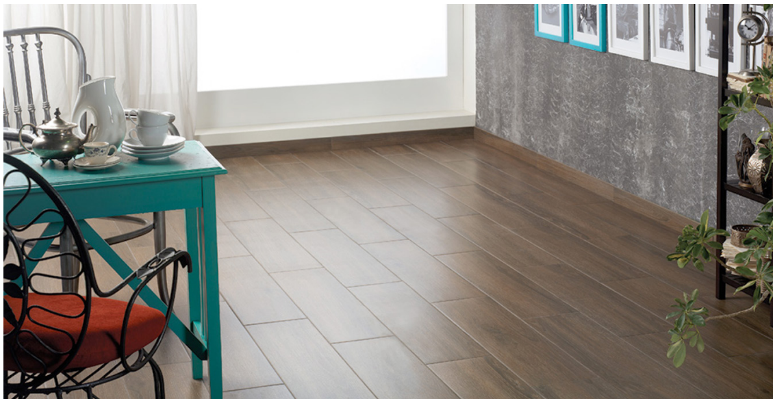
Figure 1. Product installed

In this cradle-to-gate LCA study, a cut-off rule of 1% for the energy use (renewable and non -renewable) and 1% of total mass in those unitary processes, whose data is insufficient, have been applied. In total, more than 95% of all mass and energy inputs and outputs of the system have been included, excluding the not available nor quantified data.