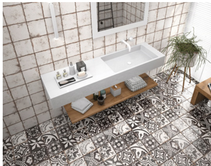
Figure 5. Installed product

It is assumed that loads are avoided in manufacturing (such as cardboard, film, and wood waste), in product installation (such as cardboard, plastics, and wood packaging waste) and in product end-of-life.