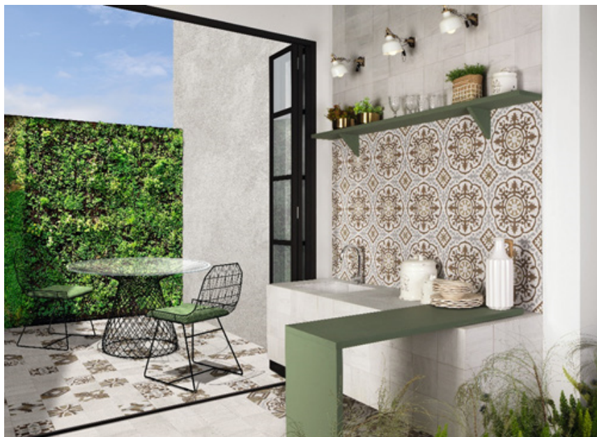
Figure 3. Installed product

The load assignments applied have been the necessary ones to quantify the specific data of the ceramic tiles as a covering material.