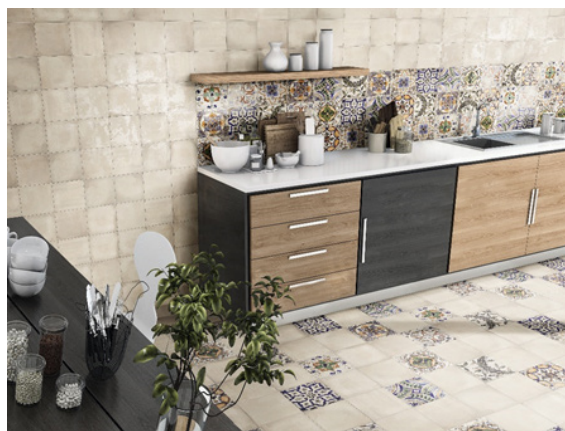
Figure 2. Installed product