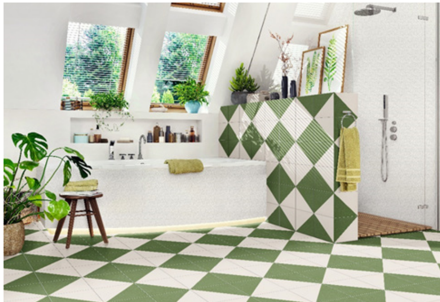
Figure 1. Installed product