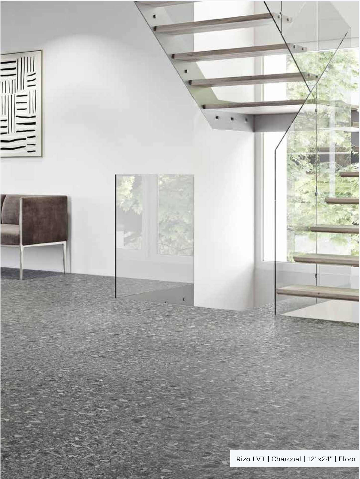
Rizo LVT | Charcoal | 12"x24" | Floor