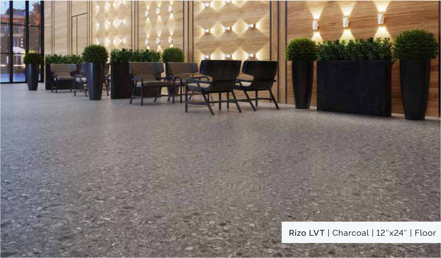
Rizo LVT | Charcoal | 12"x24" | Floor