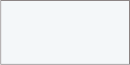
12"x24" | Glue Down