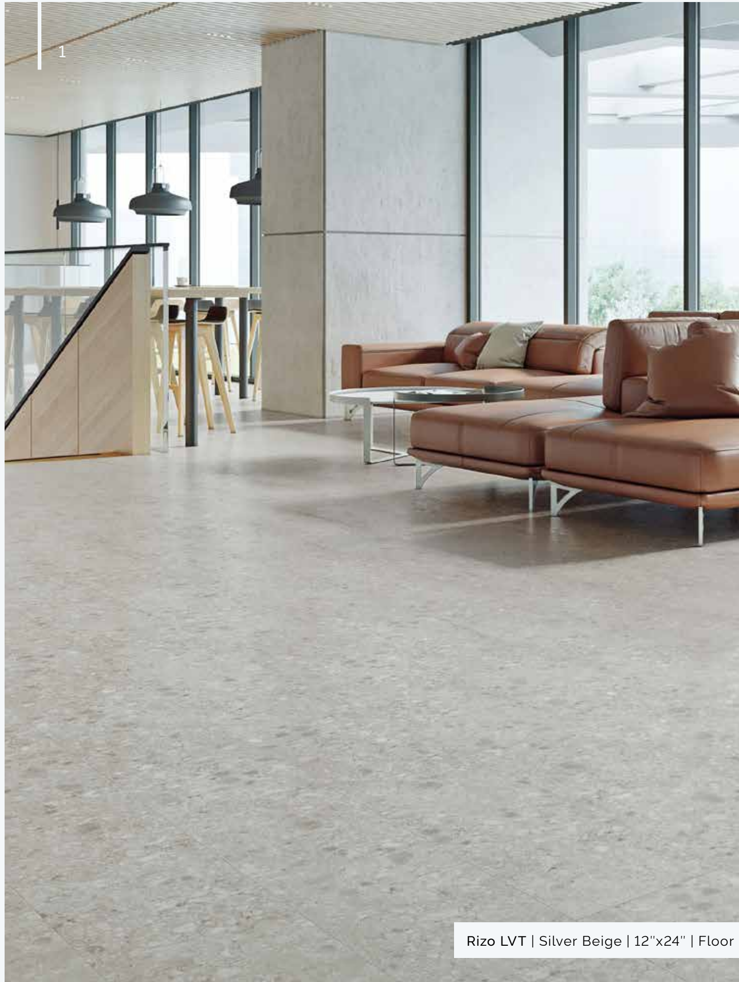
Rizo LVT | Silver Beige | 12"x24" | Floor