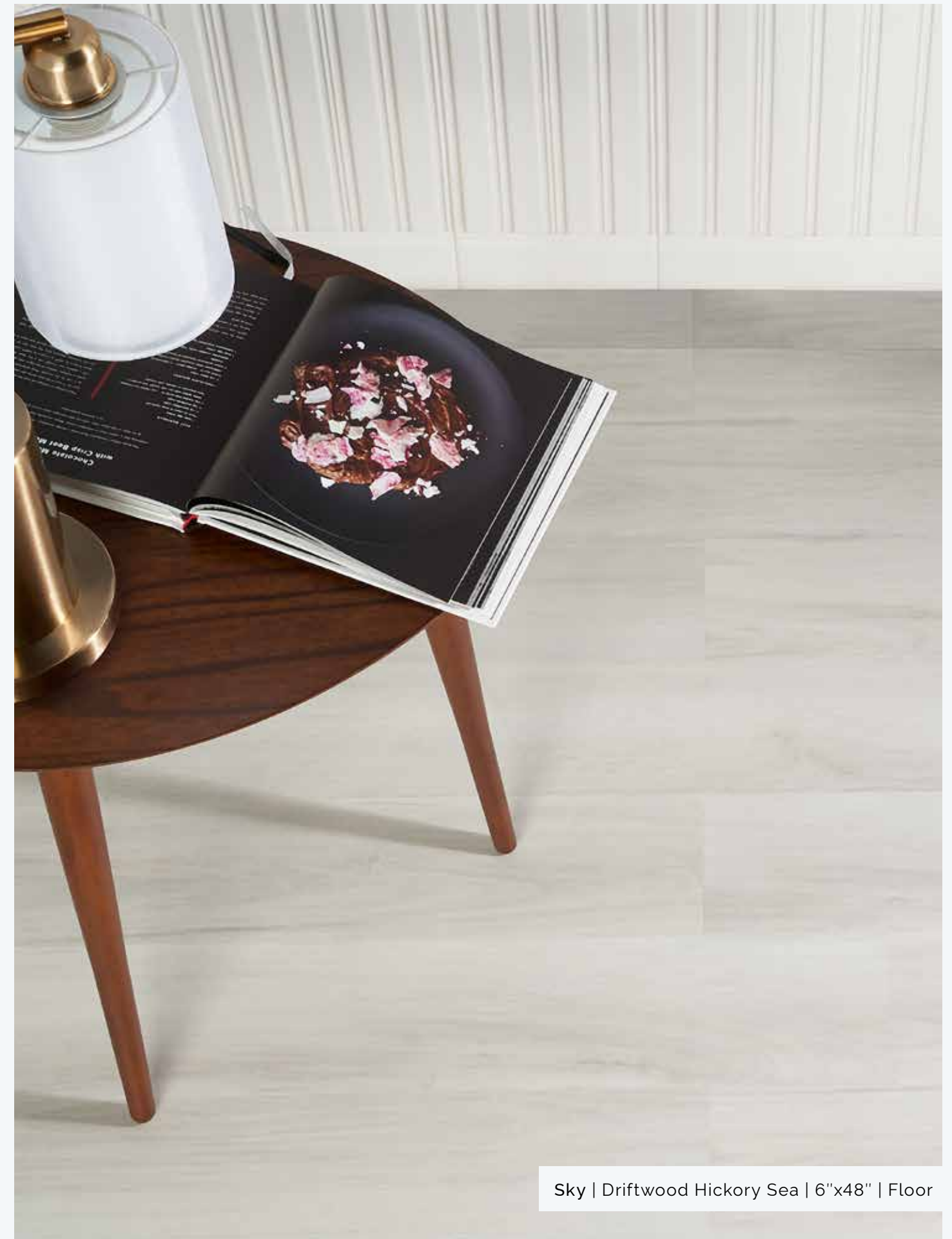
Sky | Driftwood Hickory Sea | 6"x48" | Floor