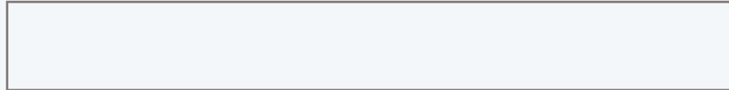
6"x48" | Glue Down