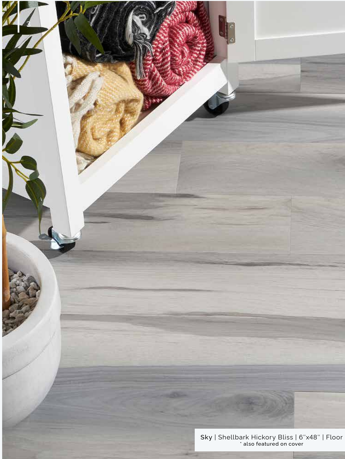
Sky | Shellbark Hickory Bliss | 6"x48" | Floor * also featured on cover