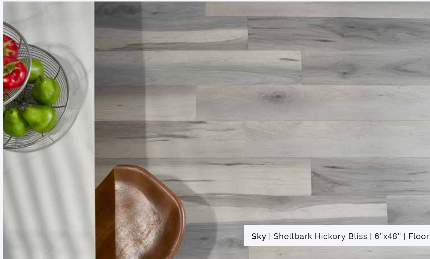
Sky | Shellbark Hickory Bliss | 6"x48" | Floor