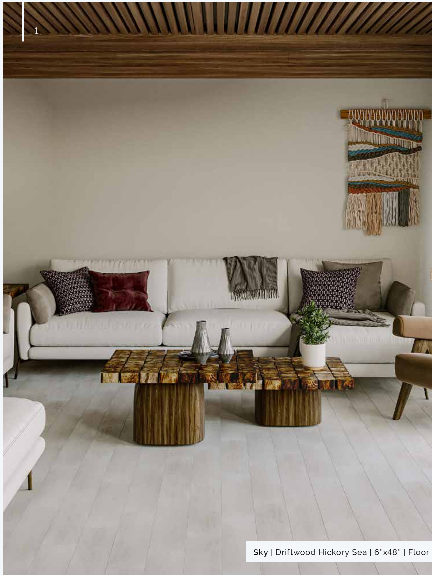
Sky | Driftwood Hickory Sea | 6"x48" | Floor