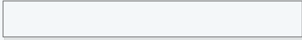
6"x48" | Rigid-Core Click